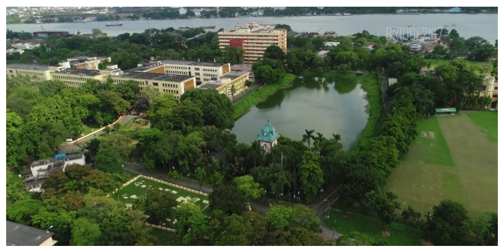
A portion of The Institute Campus

The Institute has a beautiful green campus covering an area of about 49hectares situated on the bank of the river Hooghly. It is located next to the AJC Bose Indian Botanical Garden and opposite to the Kolkata Port. The campus has a number of academic and administrative buildings, library, accommodations for staffs and students, guest house, auditorium, swimming pool, students amenities, banks, school, hospitals and general services.